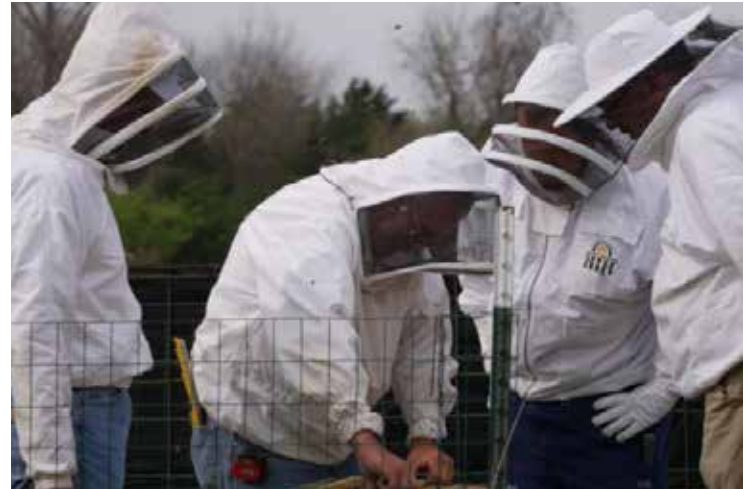
Beekeepers get a chance to sharpen their skills at MSBA's next Spring Field Day scheduled for May 2