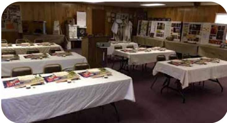
Rolla Bee Club Great Plains Master Beekeeping Program certified beginning beekeeping classes January 25 and February 15, 2020 in Rolla, Missouri